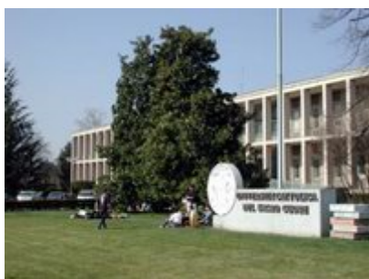
UCSC Piacenza campus

Location of UCSC, Bus Stop, and Hotel City. Red arrow indicates the direction of bus coming from the train station.